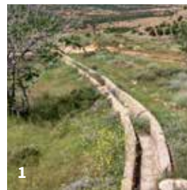
1. Water pipes in Nabha, BEKAA