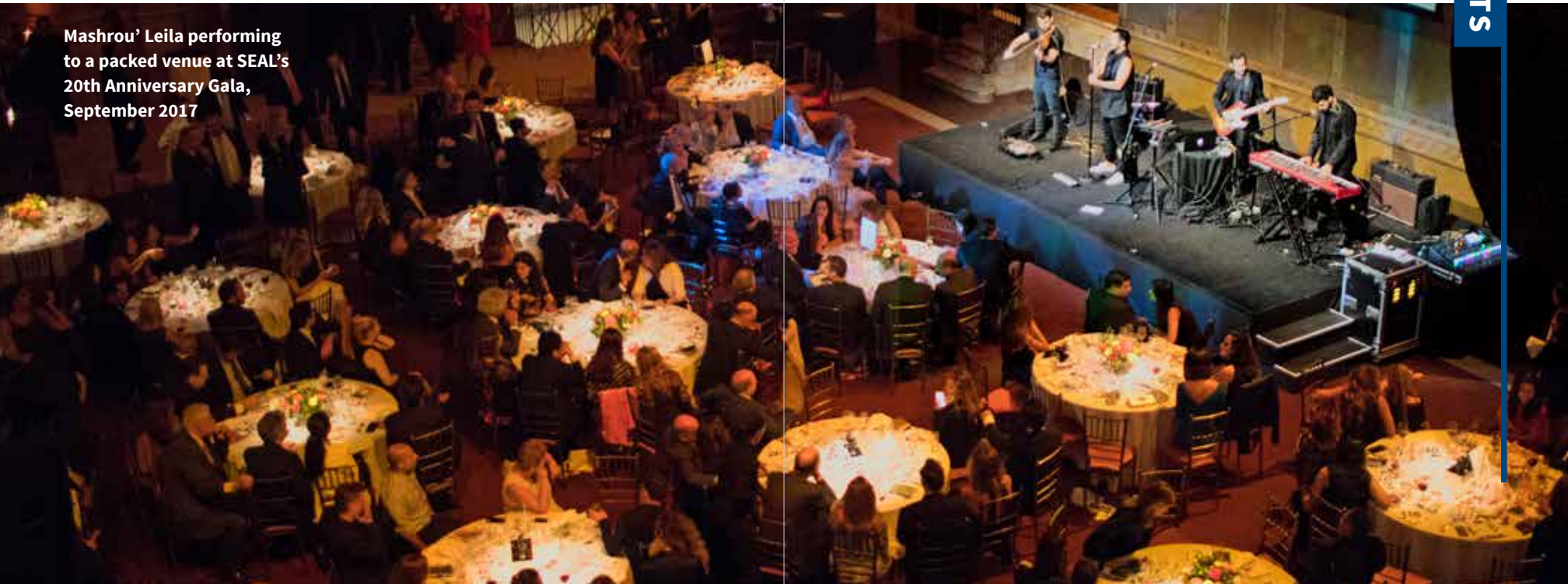
Mashrou' Leila performing to a packed venue at SEAL's 20th Anniversary Gala, September 2017