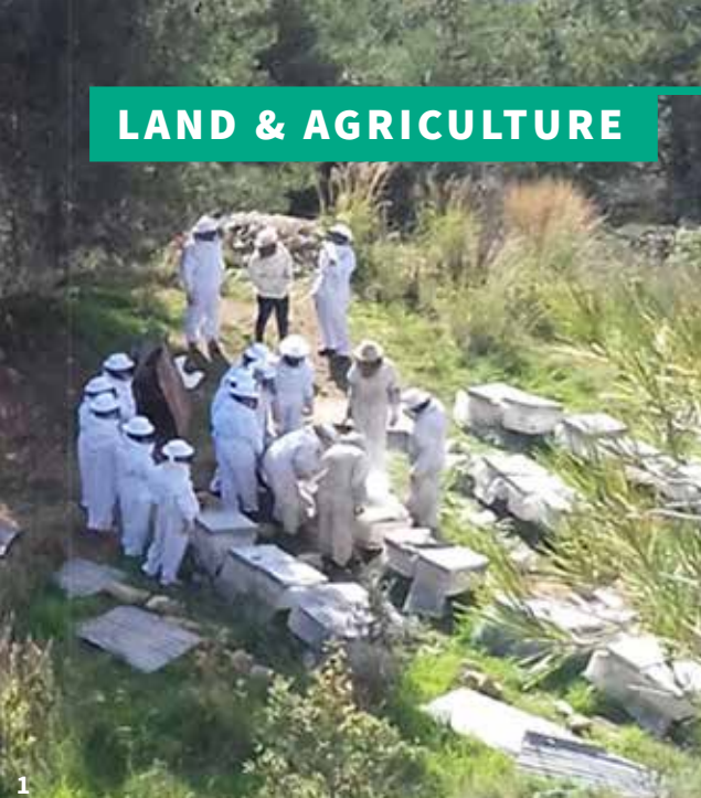
1. Tanin el Nahel beekeeping, MOUNT LEBANON Sponsored by Kamil Salame