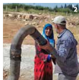
2. Water well in Anjar, BEKAA