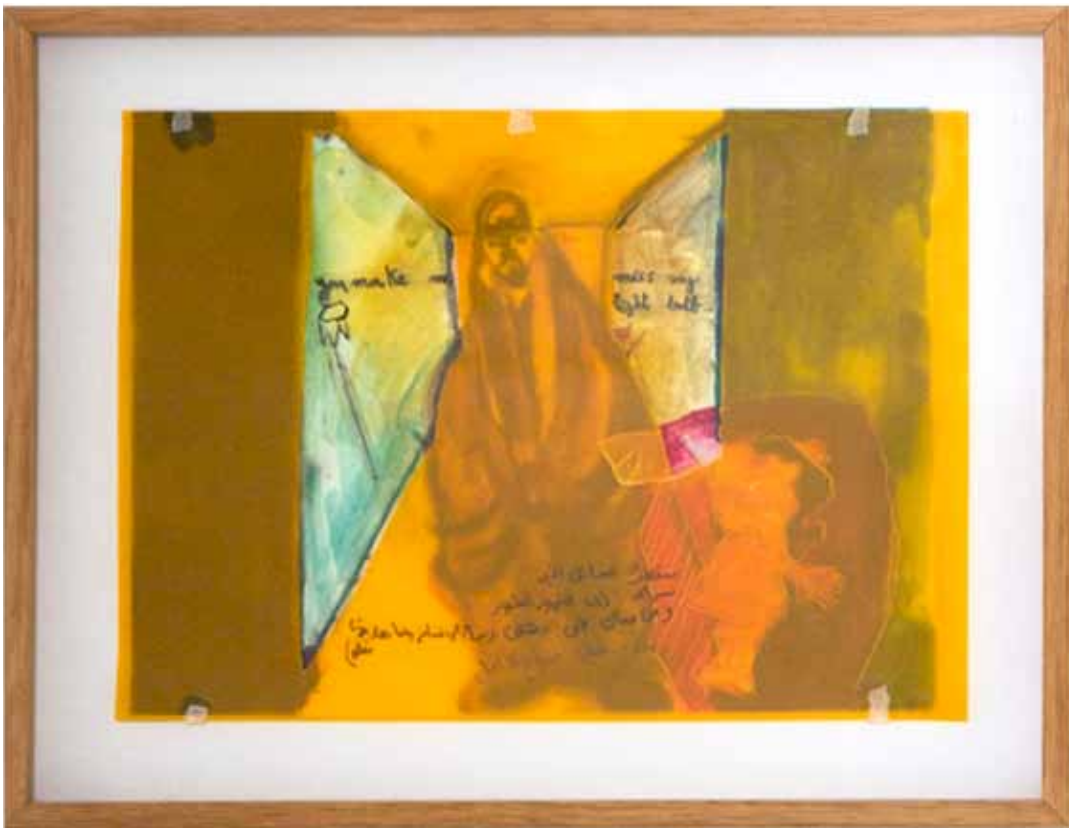
Bassam Ramlawi – from waiting blue to lingering yellow (or vice versa), 2010 Ink, water color, mixed media on paper & vellum 8-1/4 x 11-1/4 in. (21 x 29 cm.) – framed: 11 x 14-1/4 in. (28 x 37 cm.)

Value: $1,500 Starting bid @ $600 Bidding increments: $100