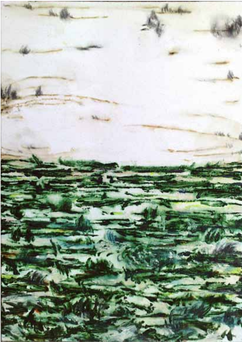
A study after Terre/Mer - 2011 Acrylic and fire on canvas 23-1/2 x 16-1/2 in. (60 x 42 cm.)

Value: $4,000 Starting bid @ $1,900 Bidding Increments: $150