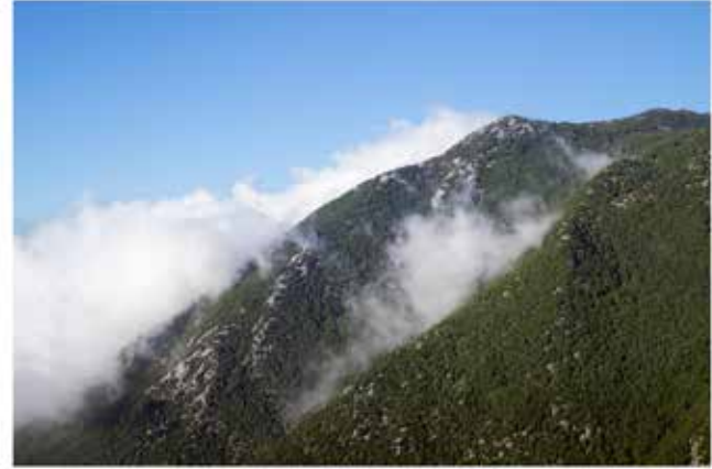
Jabal Moussa, 2016

For more information or to make a purchase please visit http://www.seal-usa.org/experiencingthemountain , or email seal-usa@seal-usa.org .