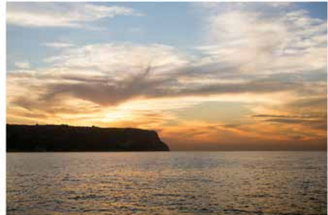
Ras Chekka, 2017